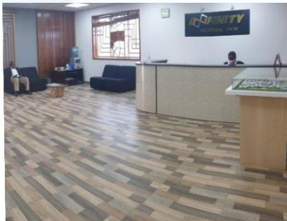
INFINITY RECEPTION AREA