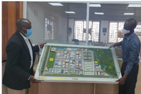
INFINITY INDUSTRIAL PARK'S MODEL