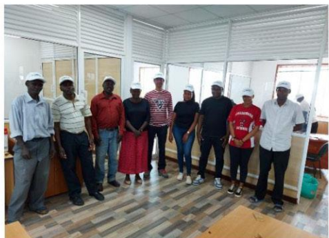
INFINITY TEAM MEMBERS