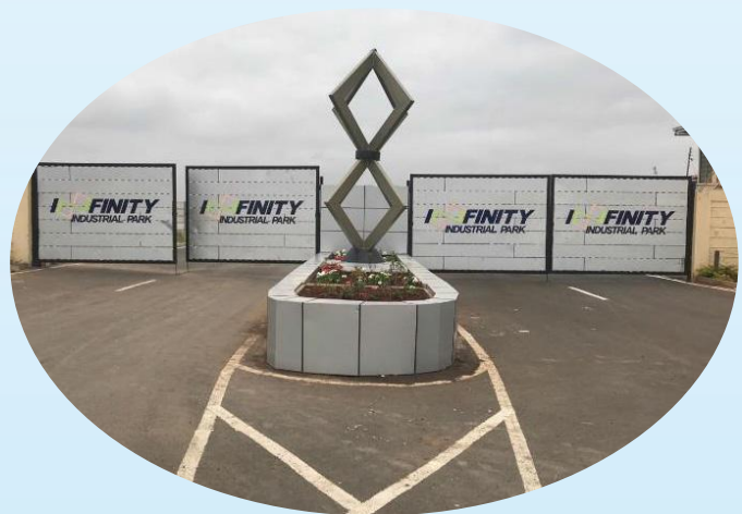
MAIN ENTRANCE GATES FOR INFINITY INDUSTRIAL PARK