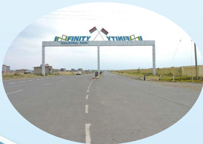
2K.M DUAL TARMAC ROAD FROM MAIN EASTERN BYPASS ROAD TO THE ENTRANCE-GATE OF INFINITY INDUSTRIAL PARK

THE GROUND BREAKING CEREMONY OF OUR INFINITY INDUSTRIAL PARK PROJECT WAS PERFORMED BY HIS EXCELLENCY HON. UHURU KENYATTA, C.G.H, PRESIDENT AND COMMANDER IN CHIEF OF THE DEFENCE FORCES OF THE REPUBLIC OF KENYA.