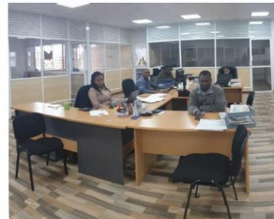
INFINITY STAFF WORKS STATION