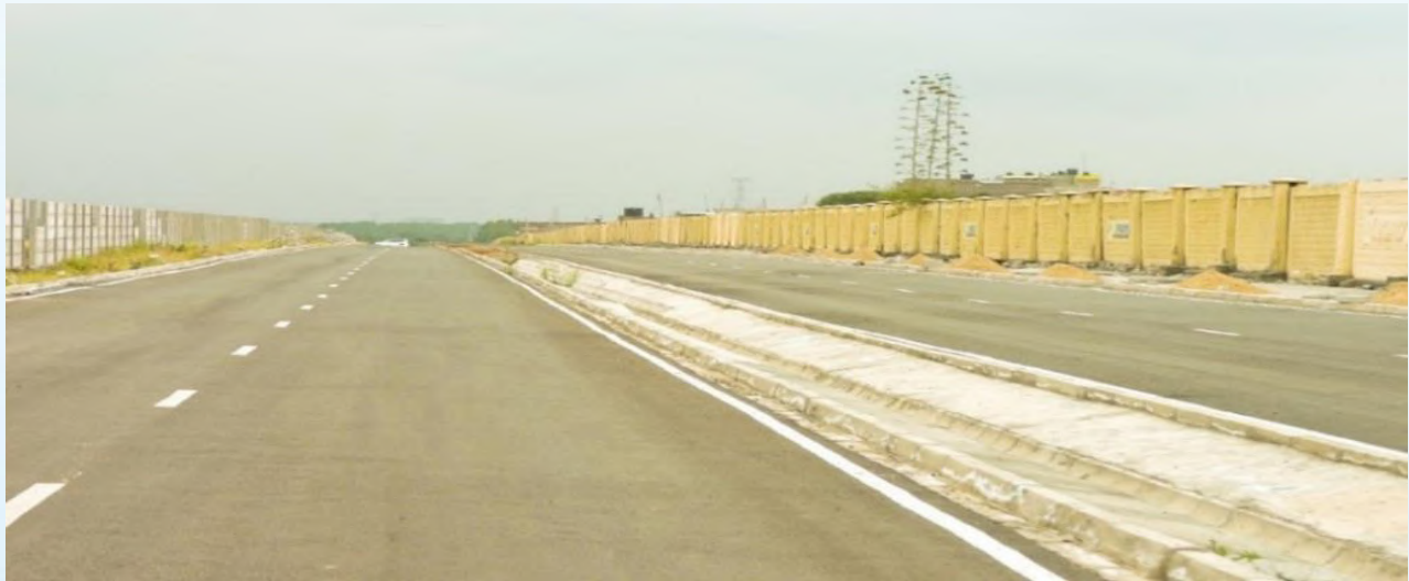
PHOTO OF BROAD INTERNAL TARMAC ROADS WITHIN OUR INDUSTRIAL PARK

There are broad internal tarmac roads with elaborate street lightings, pavements and green land-scapping within the park.